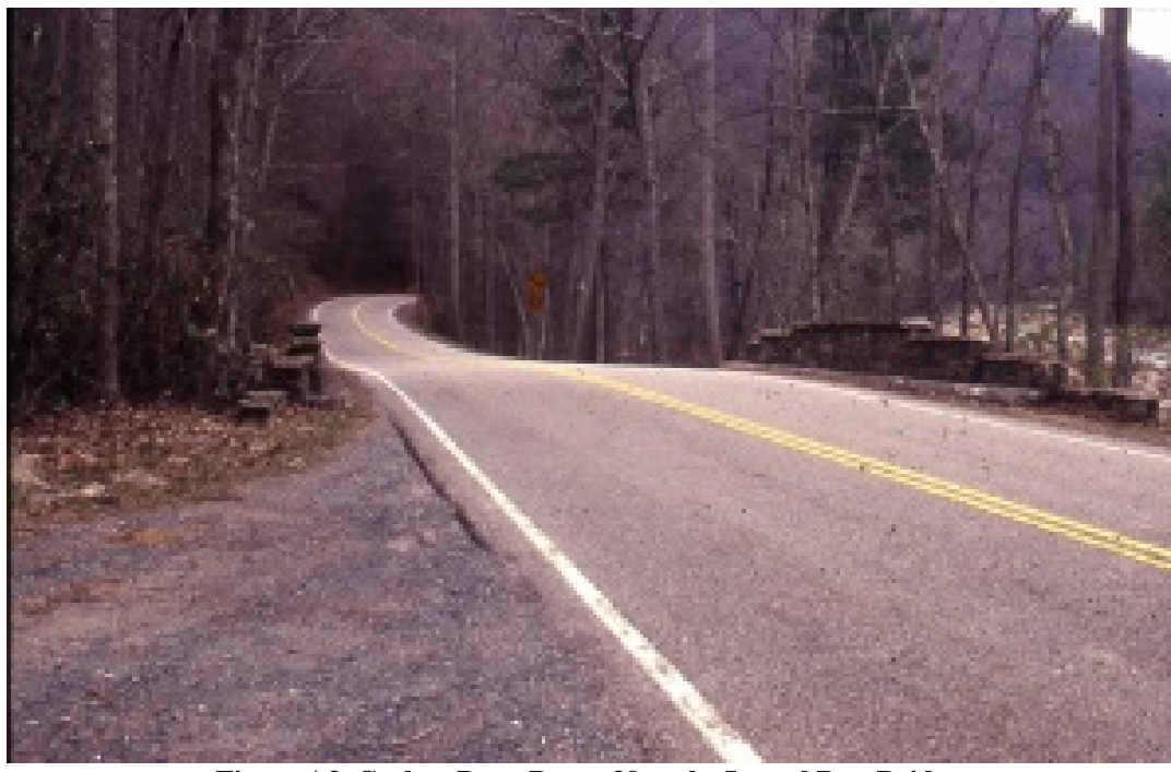
Figure A3. Goshen Pass: Route 39 at the Laurel Run Bridge