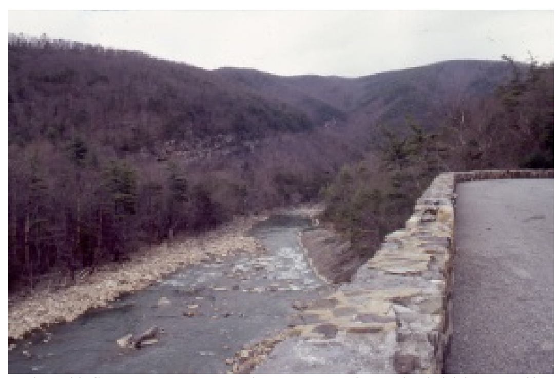
Figure A2. Goshen Pass: The Maury River From the Main Wayside Adjoining Route 39

The project was the Virginia Department of Highways' first large-scale integration of highway design and landscaping to avoid or minimize highway impact to an historic/scenic area. Ultimately the project not only avoided impact to but also actually enhanced the historic and scenic elements of the region (Figures A2, A3, and A4).