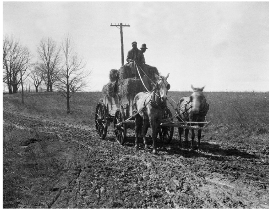
Figure A1. Georgetown Pike Near Langley, Fairfax County, 1911

5 May 1918: The road leading across the hill is the familiar Georgetown and Leesburg turnpike . . . which is just a plain and rough country road