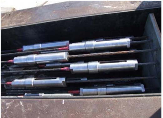
Figure 3. Elements of End Preparation: left, disassembled wedge, chuck, and braided grip; right, couplers in a pile