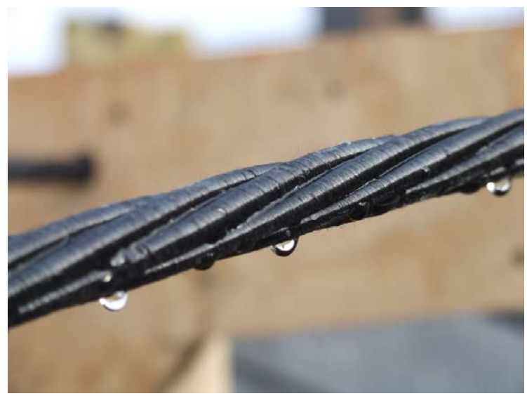
Figure 1. Water Drops on a Corrosion-Free Carbon Fiber Reinforced Polymer Strand

CFRP strands, called carbon fiber composite cable (CFCC) by the manufacturer, are manufactured by Tokyo Rope Mfg. Co, a Japanese company. Initially, this type of CFRP strand was manufactured only in Japan, but the company recently expanded and now produces CFRP in Canton, Michigan. There have been many applications of CFRP technology in Japan over the past 25 years (Enomoto et al., 2012). VDOT used these same CFRP strands in 18 piles of the Nimmo Parkway Bridge (AASHTO, n.d.; Ozyildirim and Sharp, 2014).