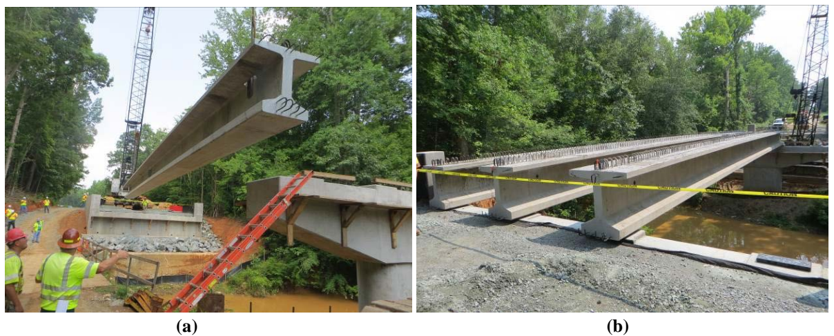
Figure 4. Bridge Construction: (a) beams being delivered to the jobsite and erection of first beam; (b) three beams in place

After the beams reached the minimum 28-day strength, they were delivered to the jobsite, with each truck and trailer transporting one beam. Two cranes were then used to place each beam. Figure 4 shows the erection and placement of the beams, with each span requiring four beams. The fabricator and contractor collaborated on a special connection to lift the beams that included blockouts in the flange and web to avoid conventional strand lifters being added to the beams and creating a corrosion issue. Conventional strand lifters using the CFRP strand were not used because of the reduction in strength when bent. The blockout is shown in Figure 4(a).